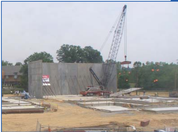
Erection of Warehouse tilt-panels.

The evidence warehouse is a 30,000 SF tilt-up including both warehouse and office space. A few of the facility amenities include a computer-automated inventory tracking system; security, including video event logging and refrigerated units for storing DNA samples.